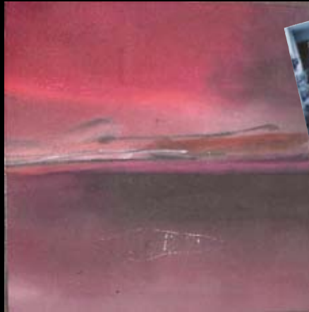
Northern Light – 50 x 50cm