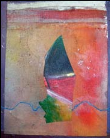
Nile – 50 x 40cm