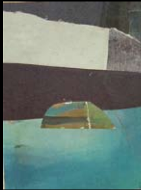
Orkneys 2 – 30 x 24cm