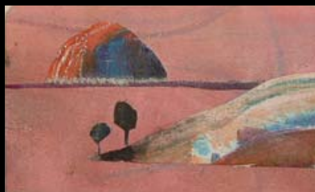
Downland/Coast 6 – 20 x 26cm