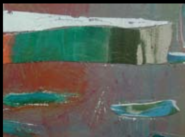
Downland/Coast 1 – 19 x 25cm