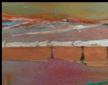
Downland/Coast 3 – 19 x 25cm