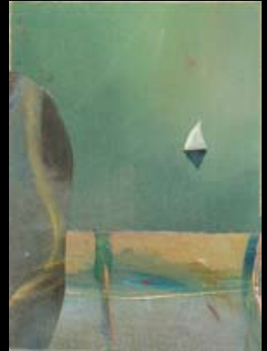
Orkneys 3 – 32 x 24cm