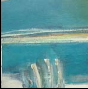
Pacific 1 – 20 x 20cm