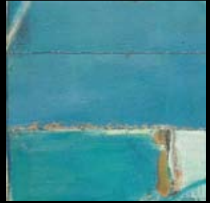
Pacific 3 – 20 x 20cm