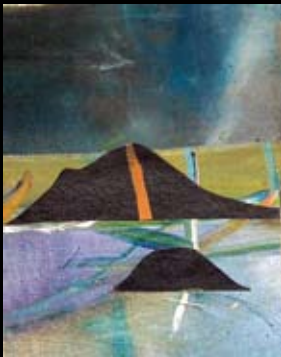
Orkneys 1 – 30 x 24cm