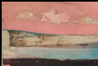
Downland/Coast 2 – 20 x 29cm