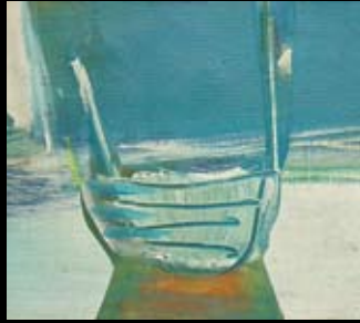
Pacific 2 – 20 x 24cm