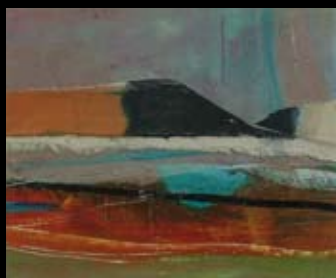
Downland/Coast 5 – 19 x 25cm